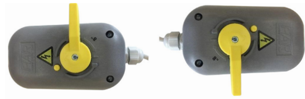
— 3-Way Valve Actuator (HPKVK3)