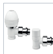
Ovus White Valve and Lockshield valve 1/2"x24/19