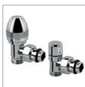
Ovus Chrome Valve and Lockshield valve 1/2"x24/19