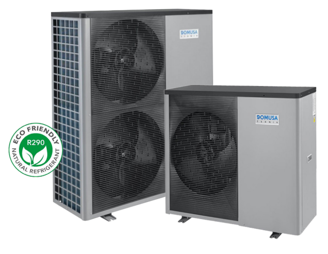
Domusa Dual Clima 16HT and 12HT